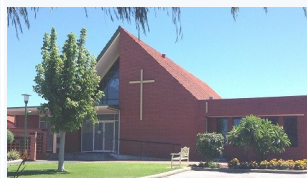
Our Lady's Assumption church

If any TCF member has found an agency or counsellor, other than those listed, To be helpful, please advise us and we will consider their information for inclusion in future issues.