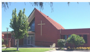
Our Lady's Assumption church