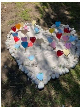
Some of the hearts with personal messages.