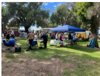
The volunteers were kept busy