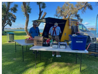
Lions Club members Prepare the sausage sizzle