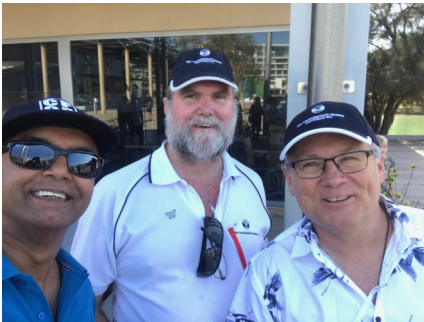
"Peel ALCOA award 2022"