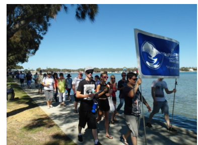
leading with our banner