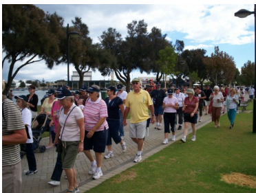
Walking along the foreshore