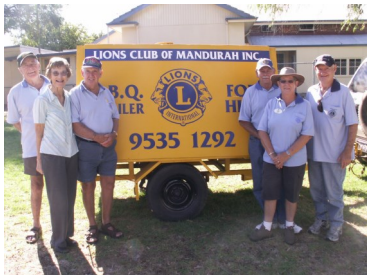
Mandurah Lions Club

We need the support of all our members to make this, our 20th memorial walk a huge success. Participating in the event, seeking sponsors and donations and spreading the word are all ways in which you can all contribute. If you cannot attend the walk we would appreciate a financial donation. Do you have a business or know some business owners who would like to sponsor the walk? They receive lots of publicity in return. Please diary note the date now. Flyers will be distributed at end January when all sponsors have been confirmed.