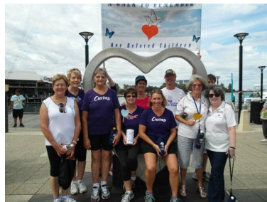
Curves Gym Team