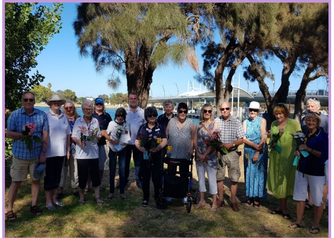
Attendees at this year's ICMD