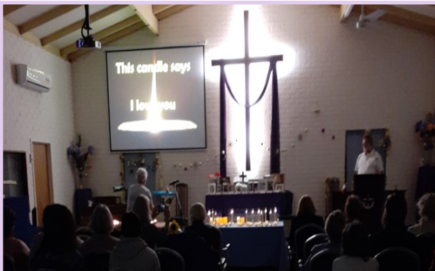
Our service at the Mandurah Uniting Church